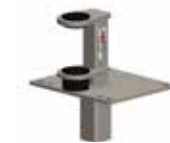
16 in. Mount