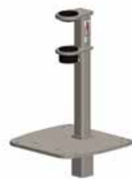
15x15 Surface Mount Plate