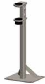
30 in. Mount