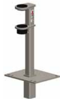
10x12 Surface Mount Plate