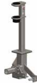
Ford 250 Ford 350