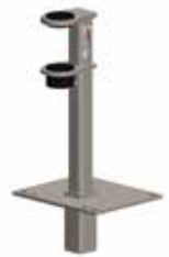
26 in. Mount