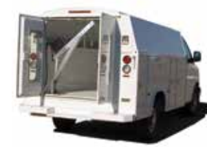
Low / Medium