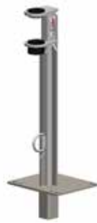
Fold-Down 37 in. Mount